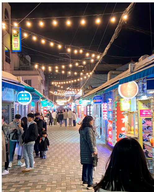
Fig. 4. The appearance of night market in Busan

research, use clear and concise language, and engage the audience with interactive elements. Finally, attendees should aim to receive awards for the best presentations, posters, or abstracts as this can enhance their professional profile in the field.