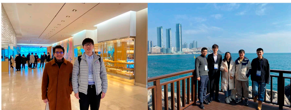
Fig. 3. Networking with young researchers from Tokyo Institute of Technology and POSTECH University

Additionally, submitting an abstract and giving a presentation is a great way to share research with the zeolite community and receive valuable feedback from experts. To prepare a successful abstract and presentation, it is important to focus on the main contributions of the